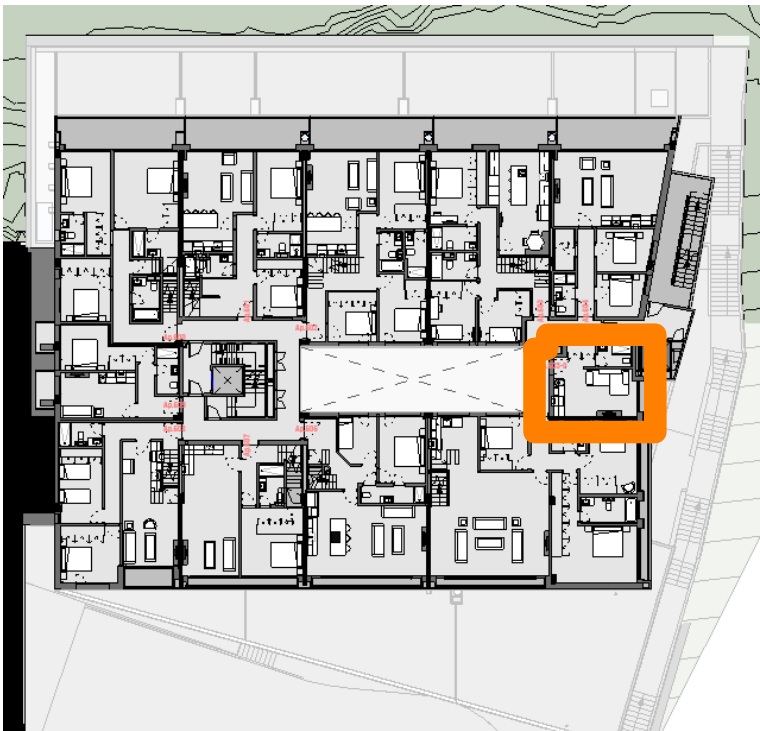
APARTMENT LOCATION. SIXTH FLOOR