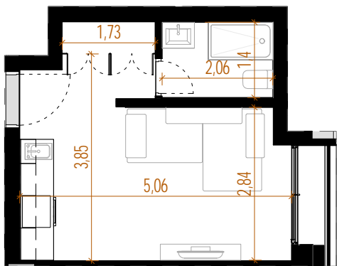
BASIC DIMENSIONS 1 : 100